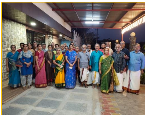
Tirumala Yatra Group

Divya Yatra : A New Yatra group was formed during this year to arrange Yatras to Divya Desams for the convenience of Vidyarthi and their Families. The highlight of this group was arranging a one day Yatra to Tirumala during March'22 in association with IRCTC. About 29 persons participated in this Yatra.