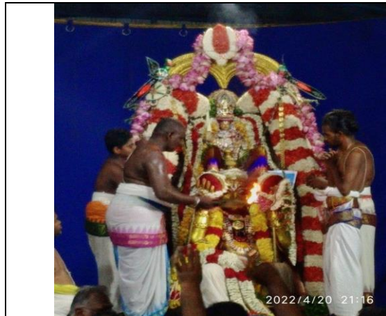
Prasanna Venkatesa Perumal Veedhi Purappadu

Sri Krishnan Temple, Kodambakkam- on the Occasion of Janmashtami Sri Vinayakar Temple, Parsn Nagar Saidapet-on the Occasion of Anusham.