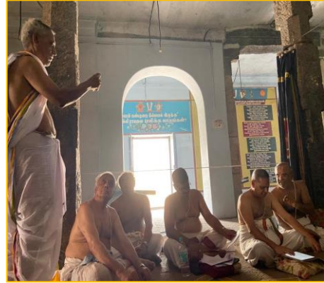
Parayanam at Tiruvelliyangudi Ramar Temple

As part of Divya Yathra activities, Darshan and Parayanam were done at the following Kshetrams: