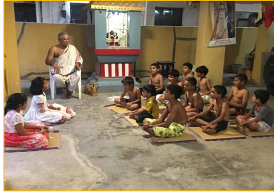
VSN class in Progress

children (girls and boys) are participating in these programmes and the classes are held during the Evening from 6:00-7:00 PM daily.