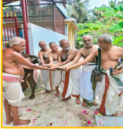
Gho Dhanam Kapisthalam

The total collections and expenses during Apr 2021-Mar 22 were Rs.677384 & Rs.675968 respectively.