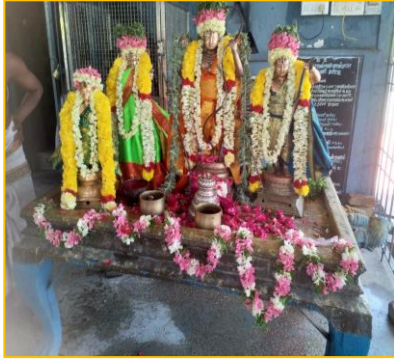
Tirumanjanam Parayanam @Ponpatar Ramar Temple